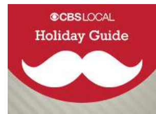
How To Supercharge Your Season