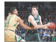
Michigan State @ Notre Dame...