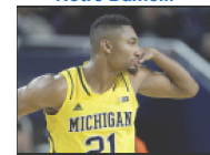
Michigan Vs. Syracuse 12-2-14