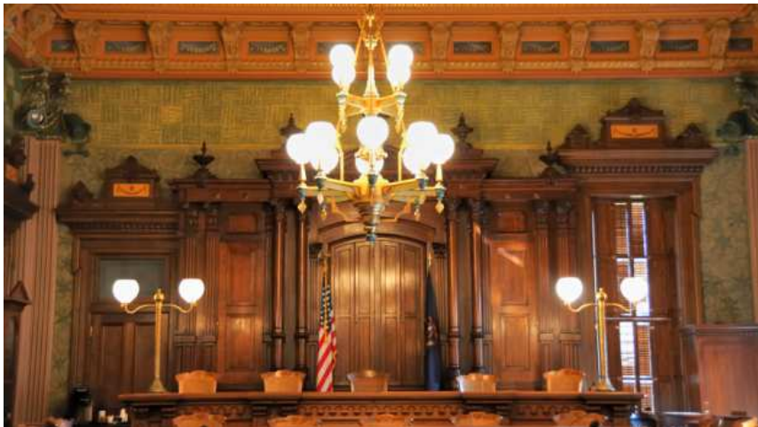
Michigan Supreme Court chamber

Related Tags: Court of Appeals , Edward Cardenas , ImageSoft , michigan supreme court