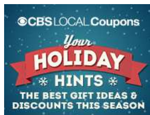
Catch Our Great Deals!