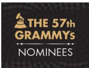
Nominees And More!