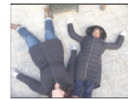
'Die In' Protest In Downtown...