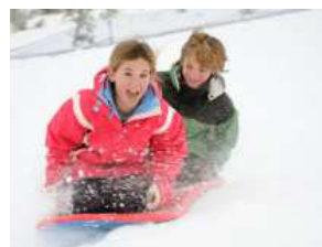
Best Free Winter Activities